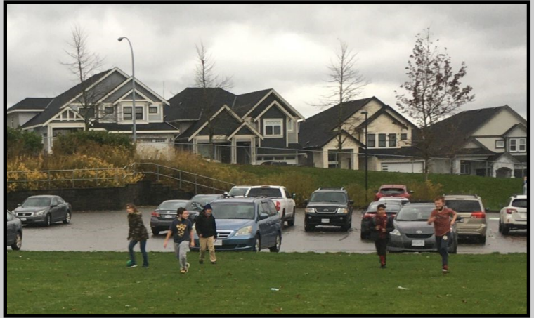
Capture the Flag at our after school club!